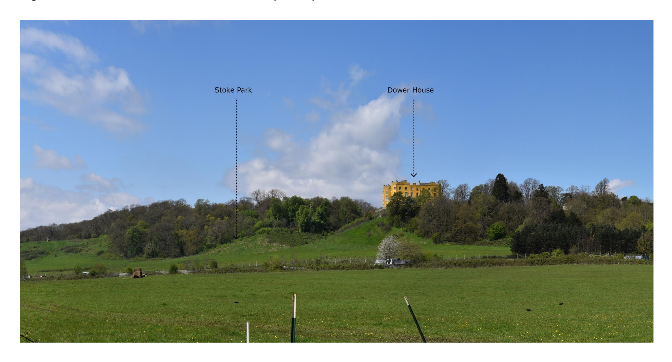
Figure 13.3: View of Sims' Hill from Broomhill (Bristol)